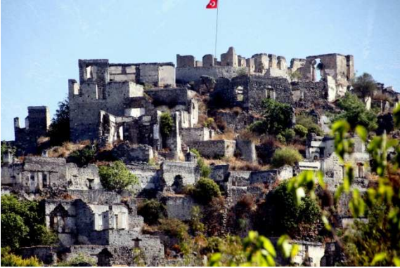
Kayakoy Peace village near Karacoeren

All you have to do is to propose a new member to the Mornington Yacht Club so that they are accepted before March 31.