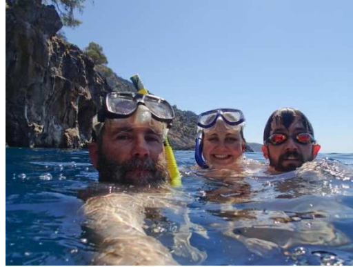
Enjoying the waters

The sailing holiday includes two weeks on a yacht as part of the Mariner Boating Turkey Yacht Rally from September 19 to October 5. If you win you will visit Fethiye, Gocek, Karacoeren, Kalkan, Kas, the Greek island of Kastelorrezo and Kekova before spending a night in a luxury hotel in Antalya. Culture, people, food, scenery, history and the action packed sailing and social program of the yacht rally will make this a truly amazing experience.