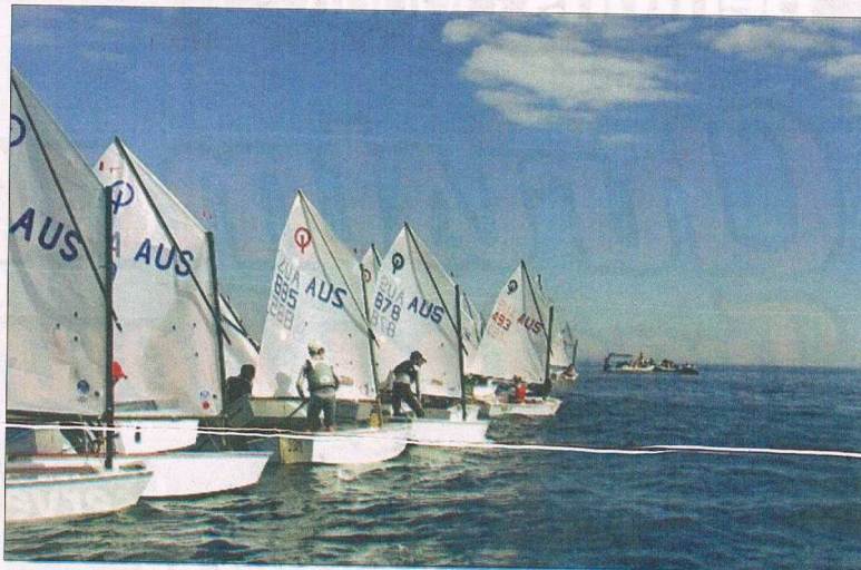
Little white yachts: More than 300 young sailors and their families descend on Mornington in early January for the weeklong 2014 Optimist Australian and Open Championships.

She said that apart from the two designated parking areas, there would be "no other traffic or parking restrictions in place".