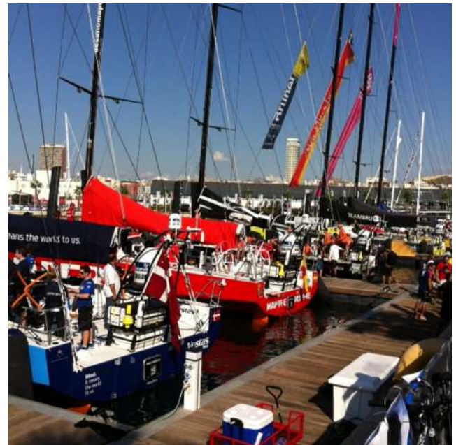
Pic 1 - Volvo 65 fleet