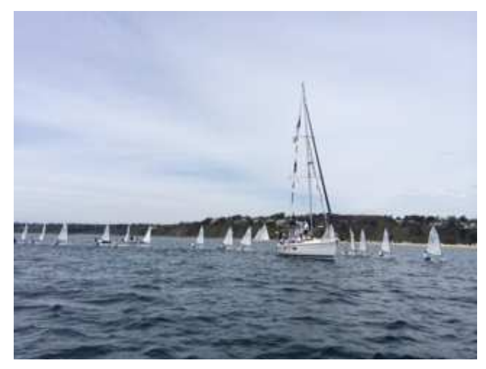
Above photo: Opti's on the Sail Past