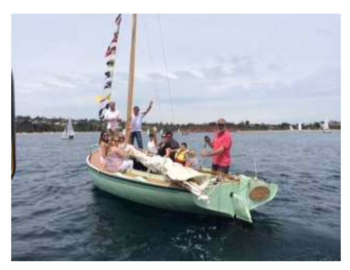
Above photo: Guests out for a Sail on "Jesse"