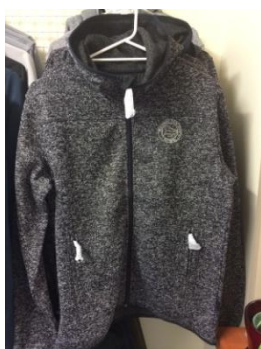
Ladies/Men's Dark grey Hoodie $99