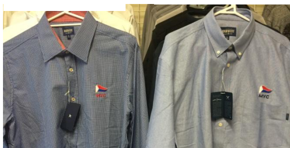
Check shirt (left) $75 Plain shirt (right) $65