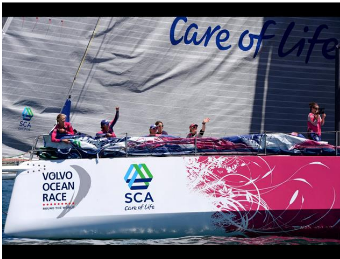
Above Photo: Crossing the finish line in Cape Town

They arrived to a hero's welcome looking tired, but fantastic.