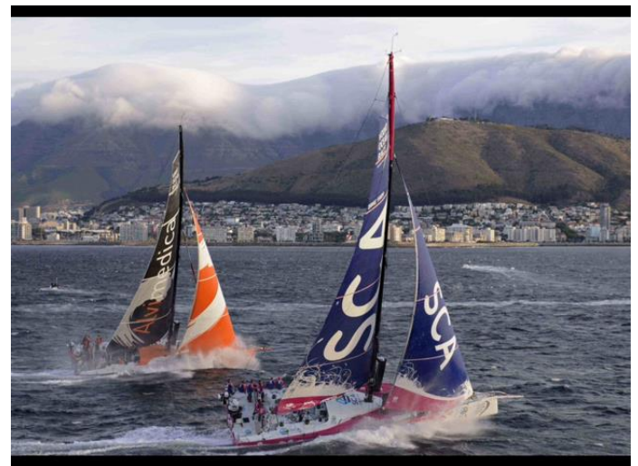
Above Photo: Blustery start to Leg 2

As you witnessed on the Volvo web site, the start of Leg 2 was blustery to the extreme, with Team SCA managing to get around the in port course cleanly and away toward the Southern Ocean leading the fleet for a while. Very exciting!