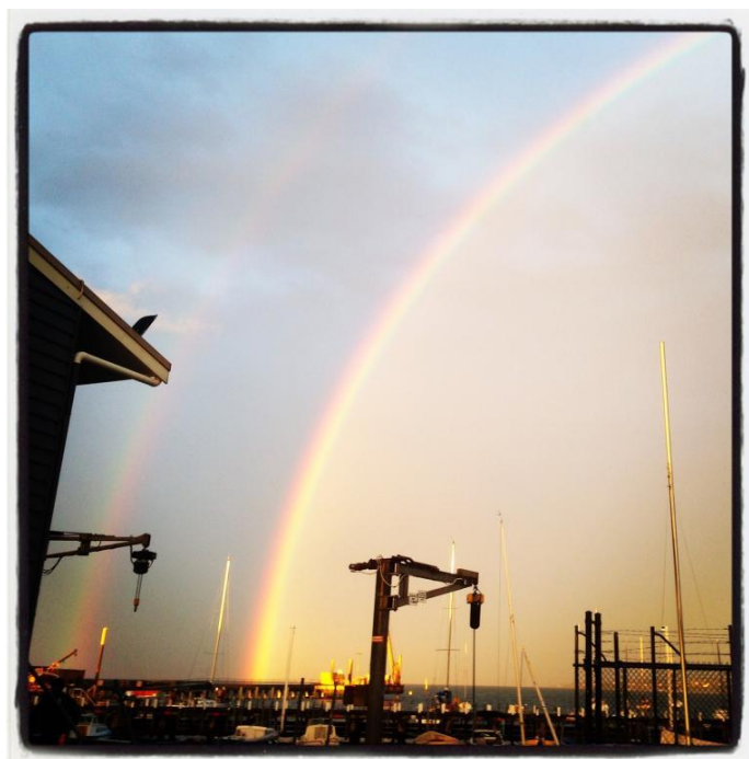
Above photo: Last Thursday, a night of contrast's