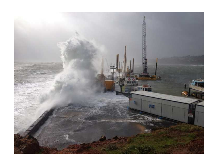
"Yesterday's winds" check out our facebook page for more photos

relax and enjoy another pleasant night at MYC.