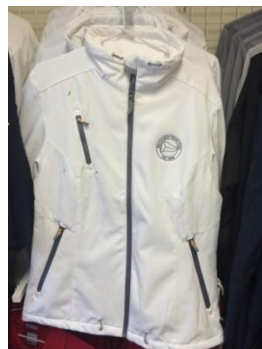
Ladies/Men's White/Navy/Black savannah $110