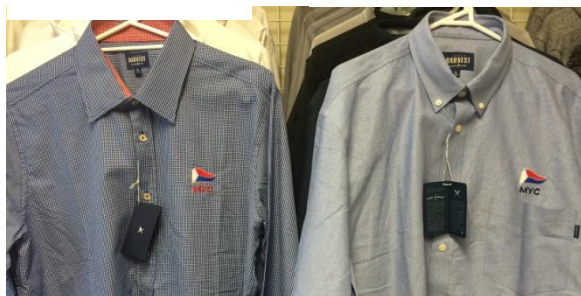
Check shirt (left) $75 Plain shirt (right) $65