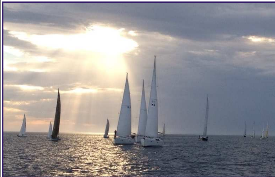
Twilight