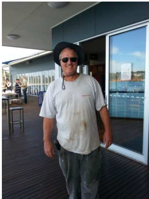
"our esteemed Commodore in all his finery on Saturday !!!"