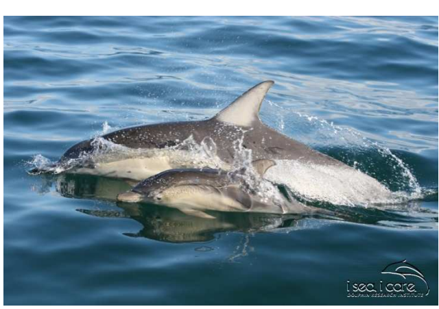
Above photo: Common Dolphins – Esther & Calf

There are 2 species of dolphins resident in the bay, the bottlenose/Burranun and the short-beaked common dolphins. The Dolphin Research Institute have been monitoring them since 2007. Prior to this they were considered casual visitors to the bay – MYC is very lucky to have these on our doorstep!