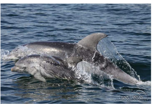
Above photo: Common Dolphins –Mum & Calf Bottlenose

It would be great to see as many of you as possible as Sue is very keen to make connection with our members & we've heard great feedback on her talk.