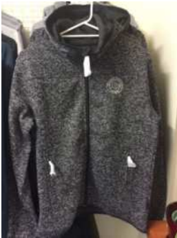
Ladies/Men's Dark grey Hoodie $99