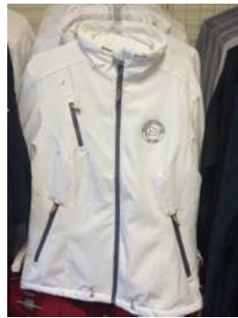
Ladies/Men's White/Navy/Black savannah $110