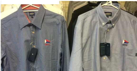
Check shirt (left) $75 Plain shirt (right) $65