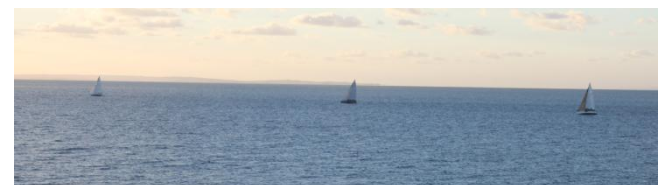
First Light heading inside the Mussel Farm