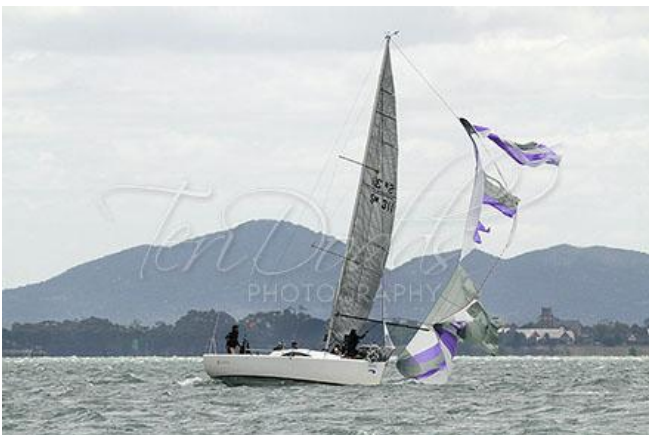
Above photos: Festival of Sails continued