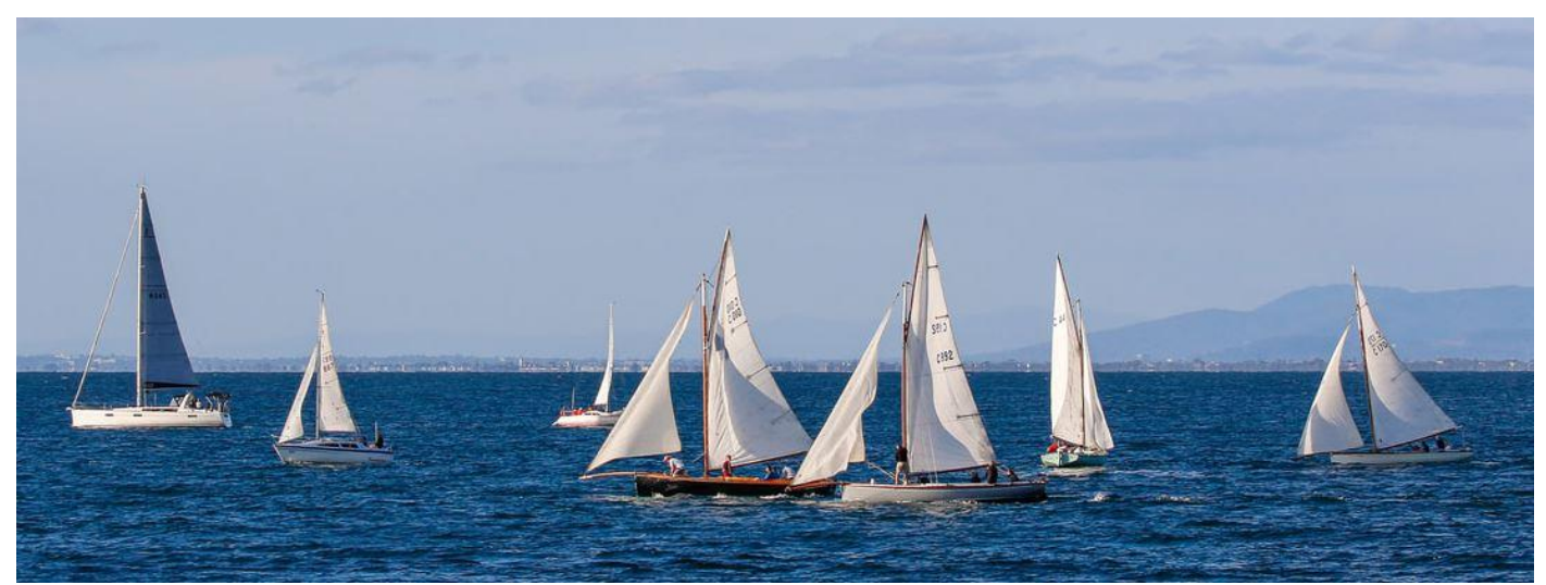
Above photo: Twilight Sail at MYC by Al Dillon