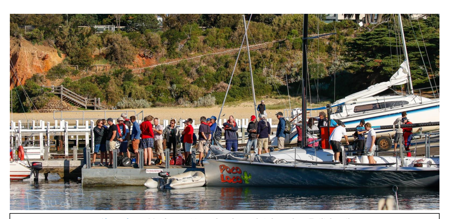
Above photo - Members waiting to be taken to their boats for a Twilight sail