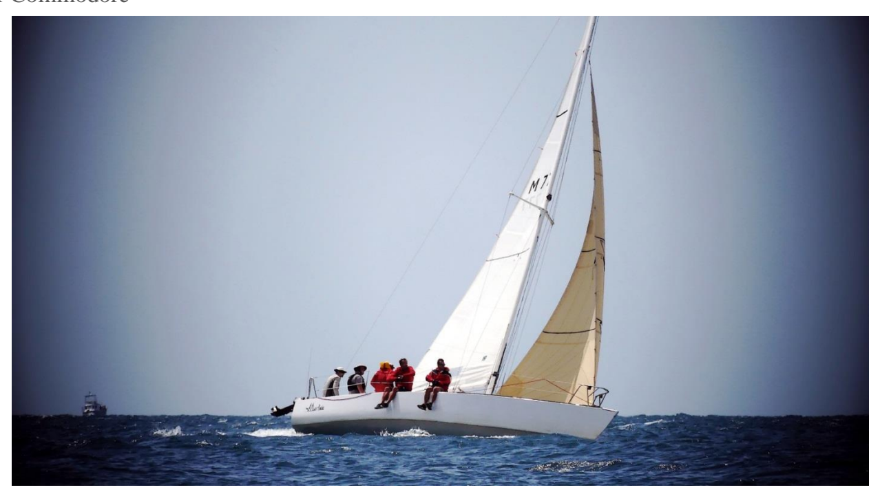
Above photo: Morticia