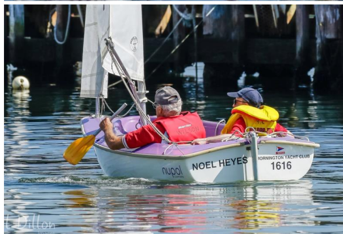
Above photos – MYC Sailability