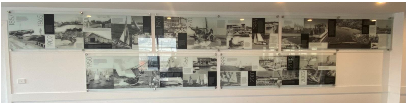
Above Photo: Newly completed MYC History Wall

Our debt shadow is now more manageable we have been able to plan and undertake an extensive range of works. We are fortunate to have a large body of people who continue to provide their skills either in kind or well below commercial rates enabling us to execute projects very cost effectively.