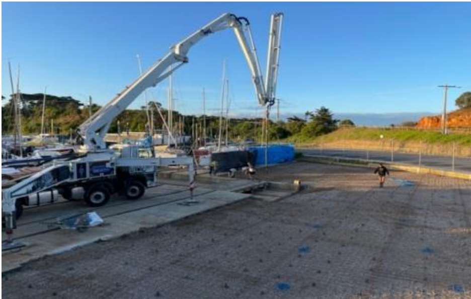
Above Photo: Concreting the yard