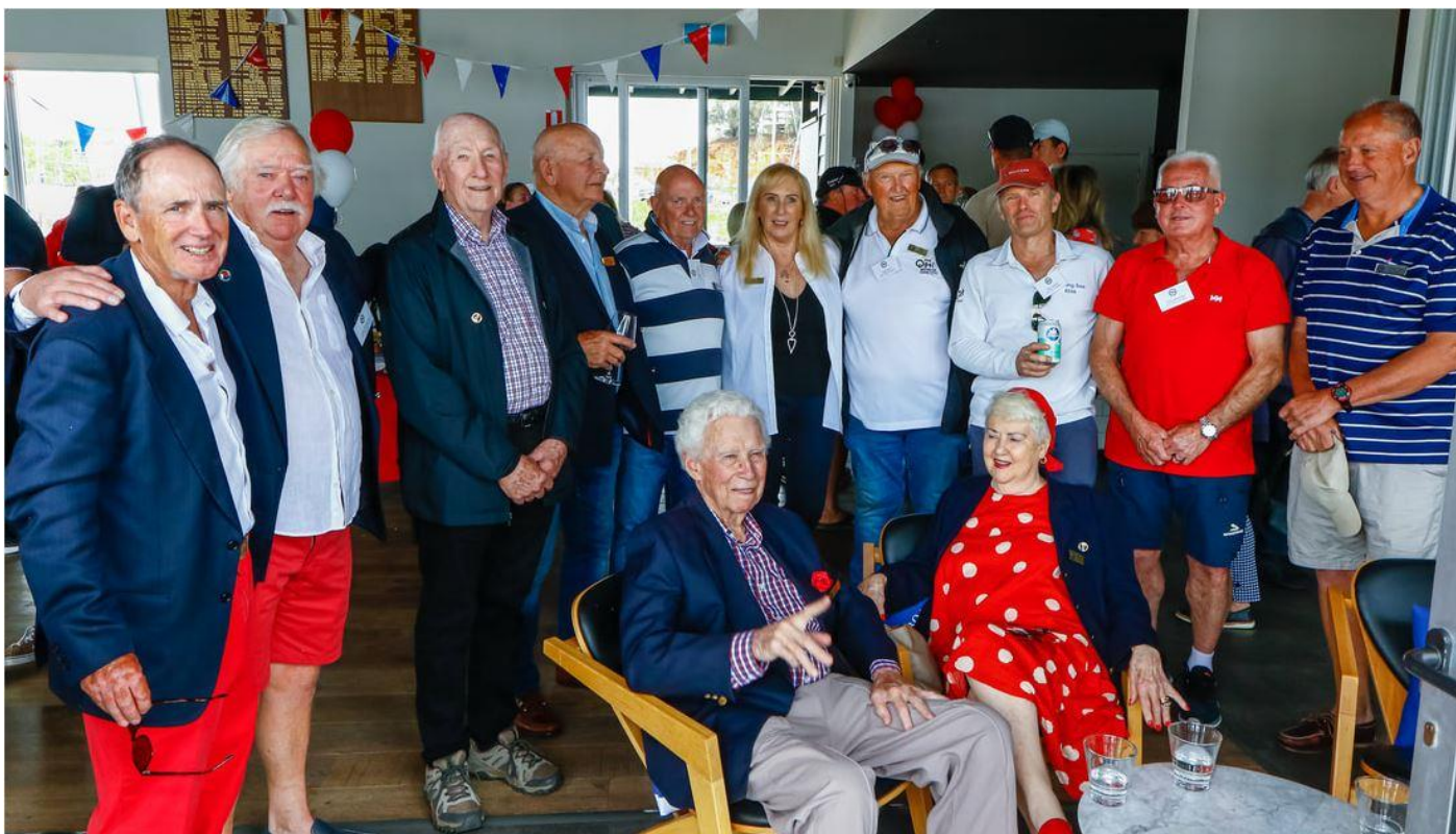
Above Photo: Current + Past Commodores at Opening Day