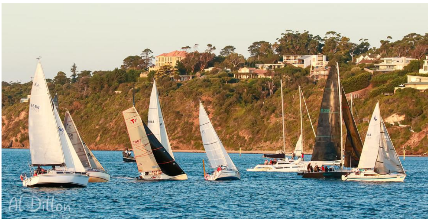
Above photo: A glorious Twilight Sail at MYC